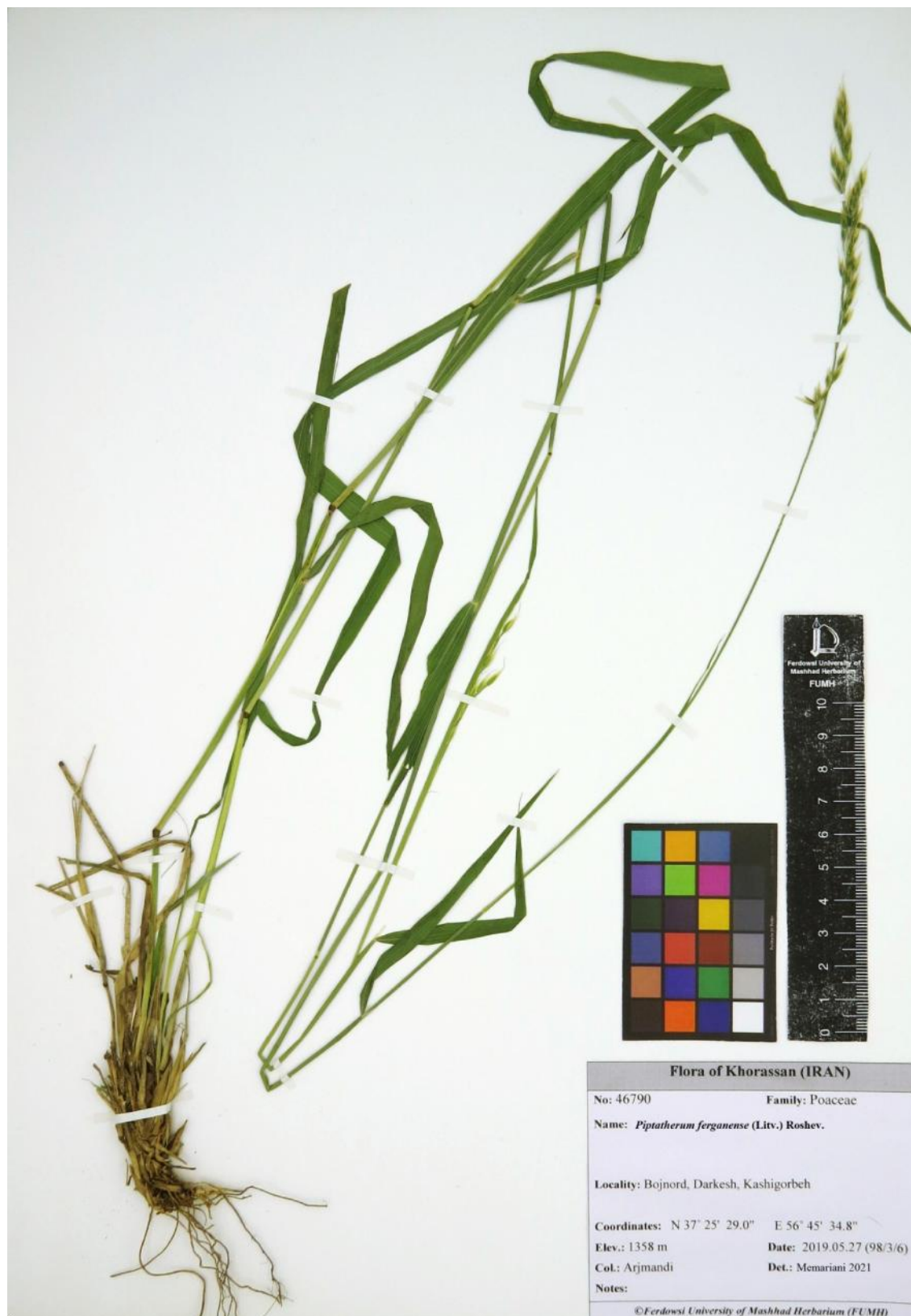
Figure 1. Herbarium specimen of Piptatherum ferganense (Arjmandi 46790-FUMH).