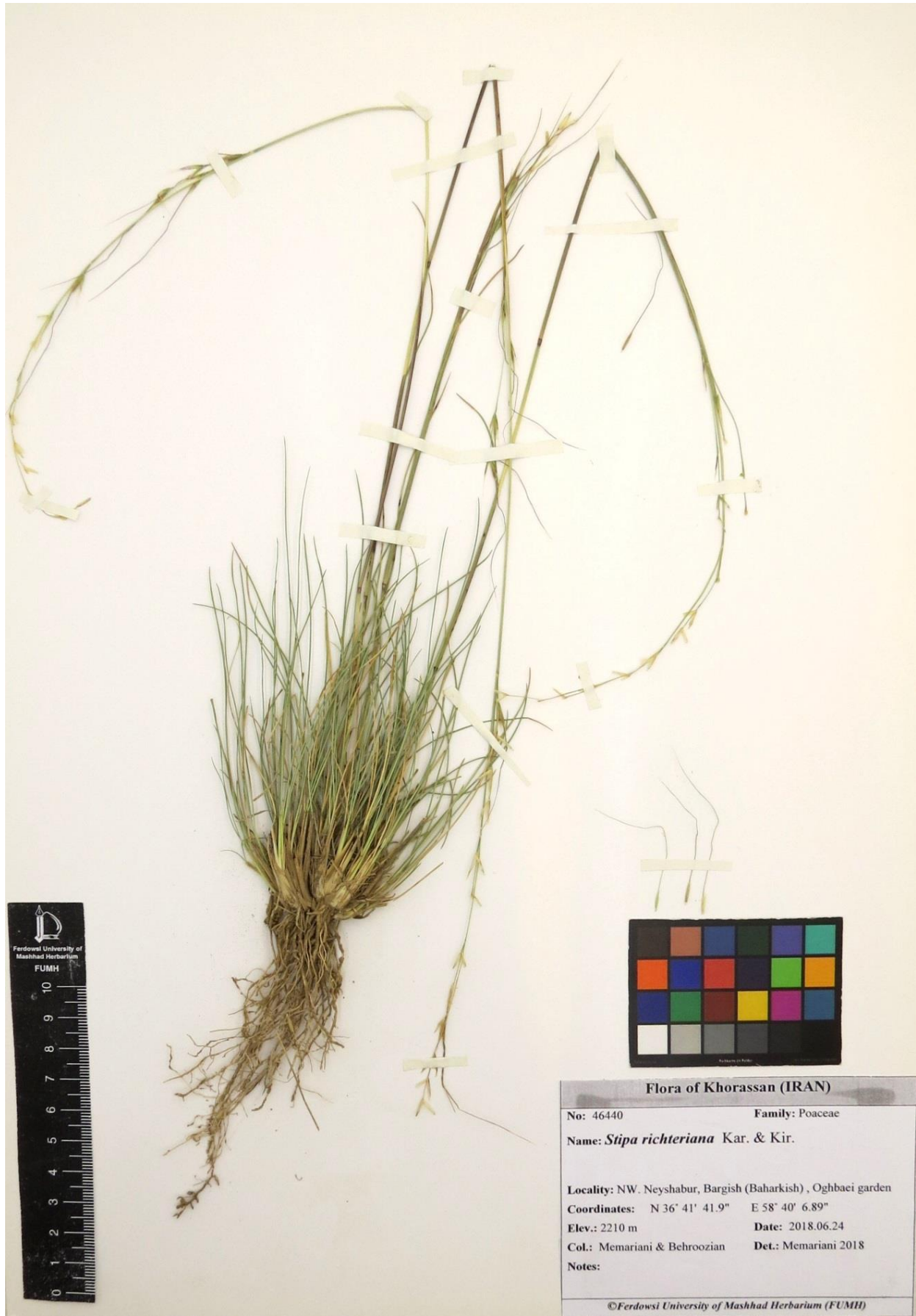
Fig. 1. Herbarium specimen of Stipa richteriana (Memariani & Behroozian 46440, FUMH).