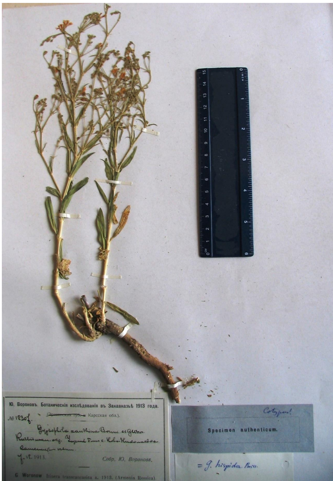
Fig. 2. Syntype of Gypsophila xanthina (Woronow 12307, LE!).