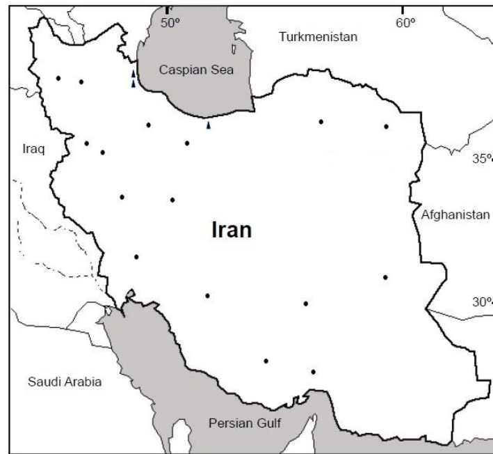
Fig. 3. Distribution of Alyssum szowitsianum (●) and A. mazandaranicum (▲) in Iran.