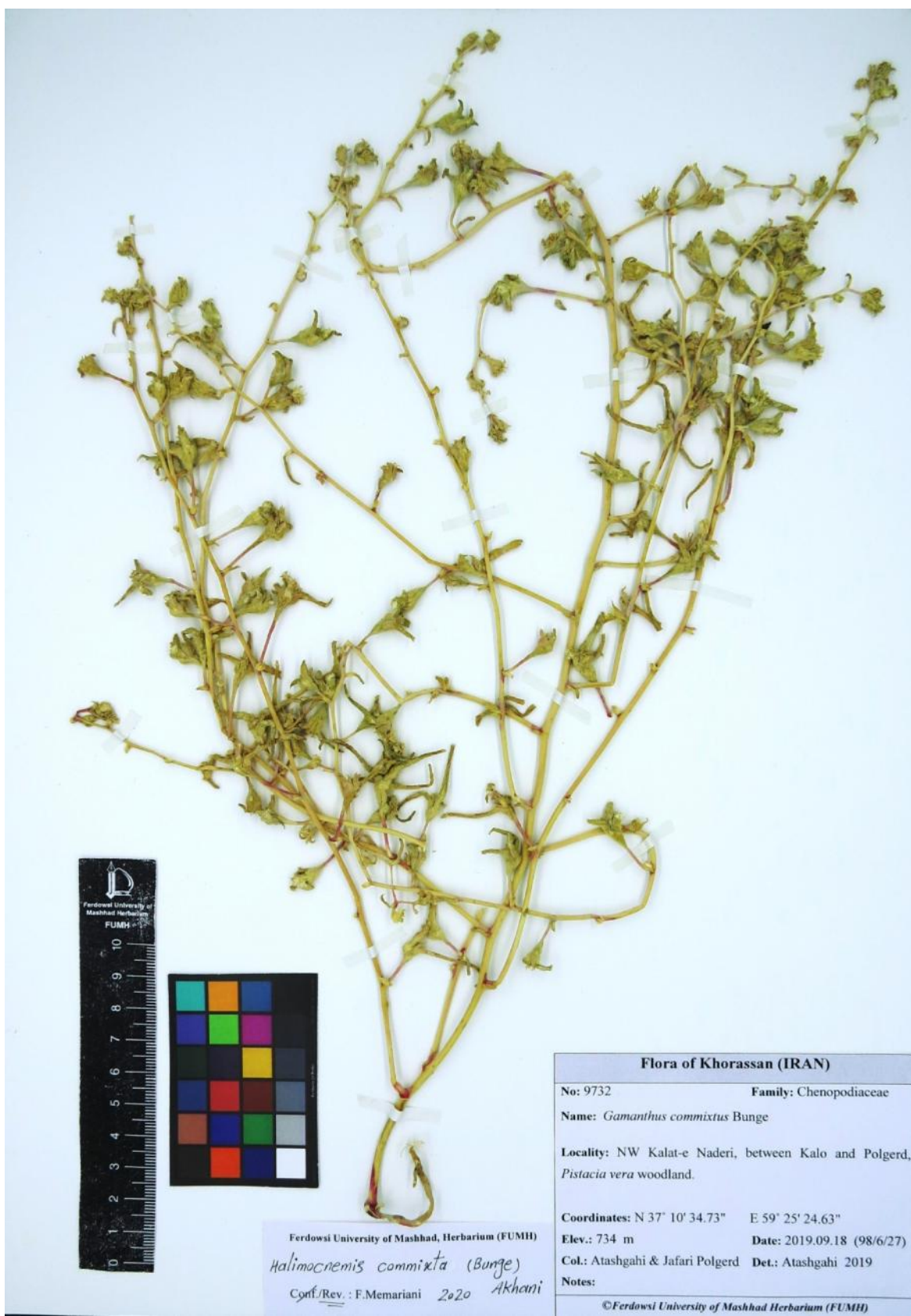
Figure 1. Herbarium specimen of Halimocnemis commixta (Atashgahi & Jafari Polgerd 9732-FUMH).