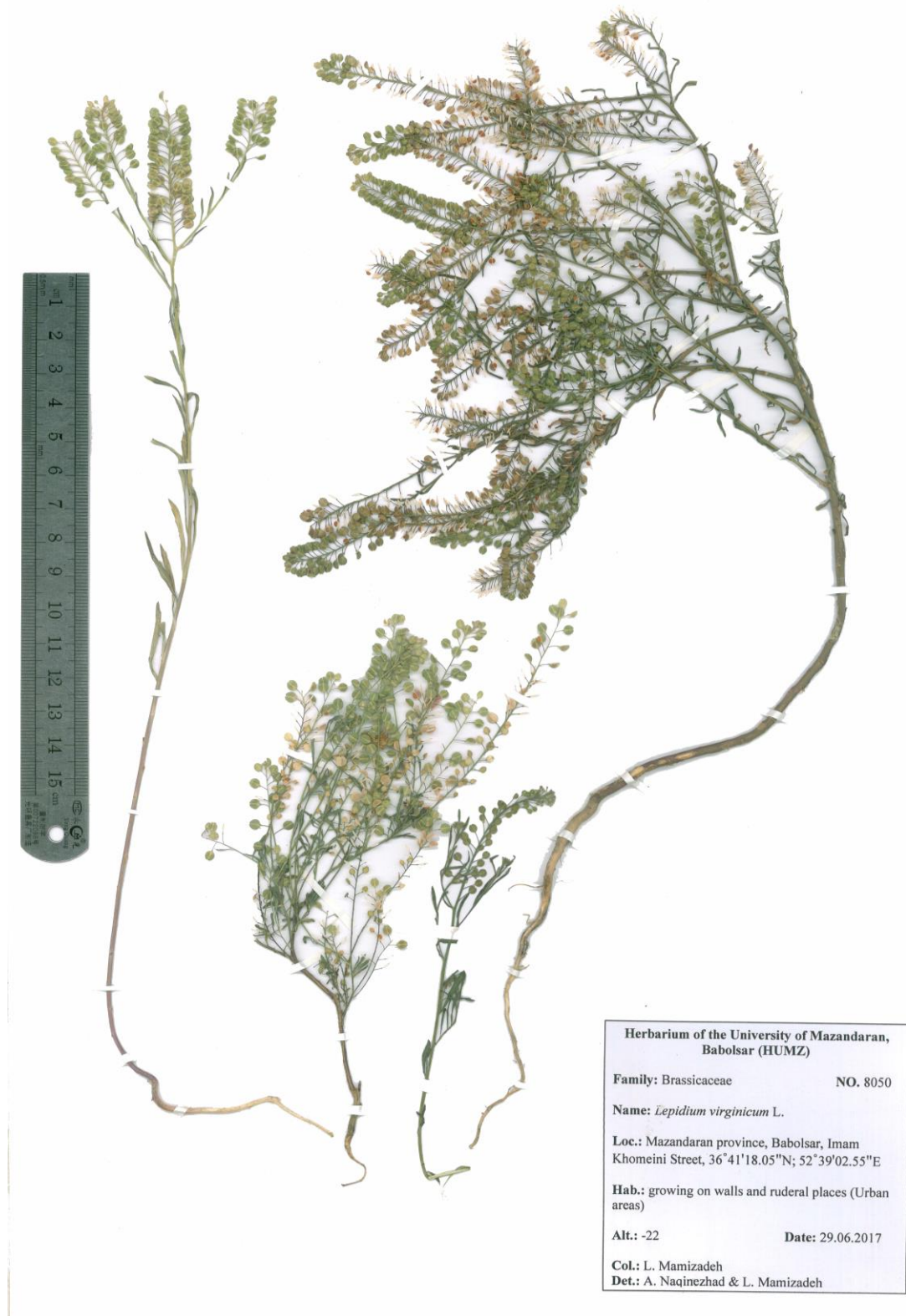
Fig. 1. Lepidium virginicum .