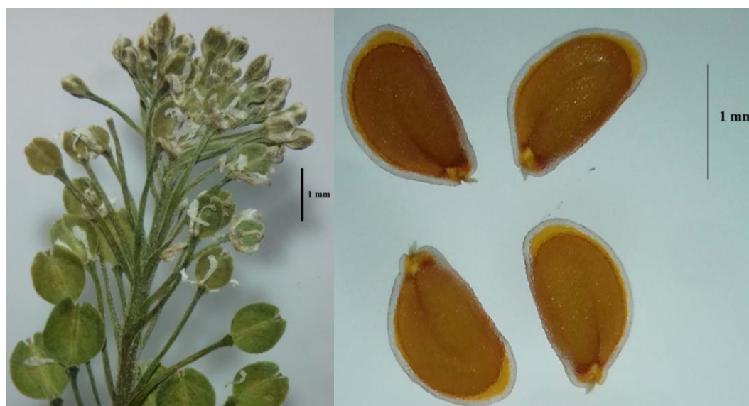
Fig. 3. Inflorescence (left) and seeds (right) of Lepidium virginicum .