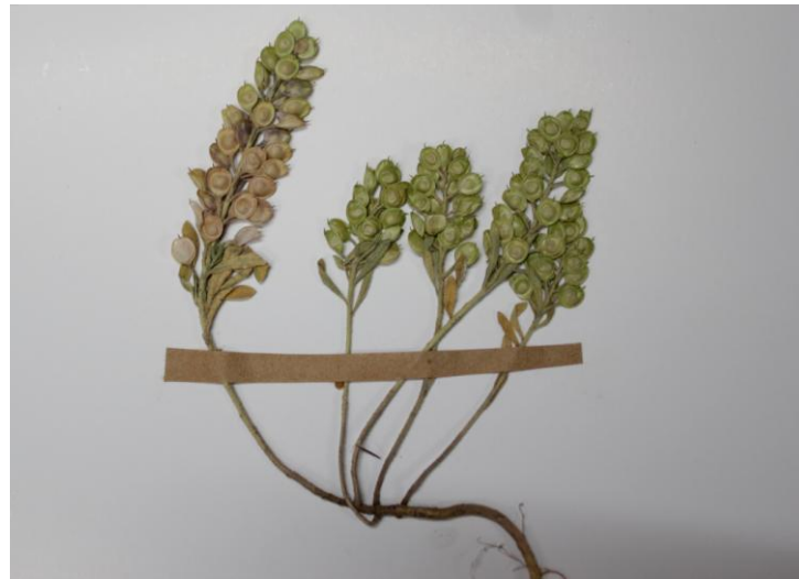
Fig. 1. Plant on sheet of Herbarium ( A. mazandaranicum ).