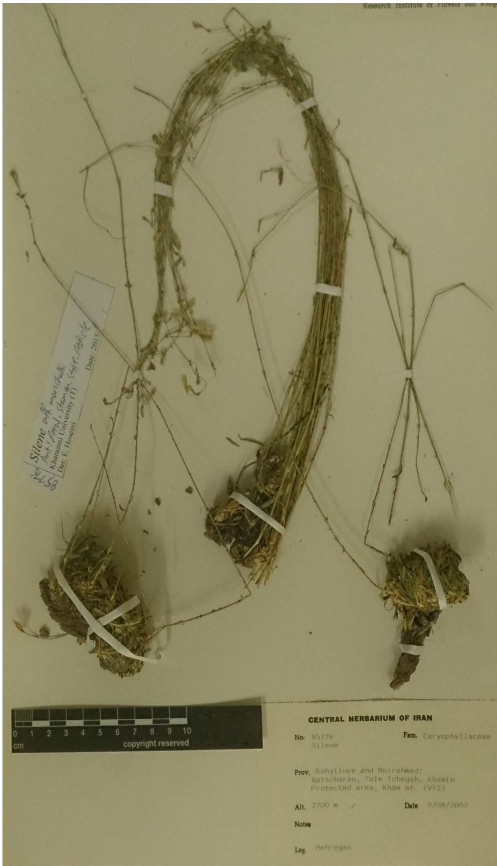
Fig. 1. The type specimen of Silene gahremaninejadii .